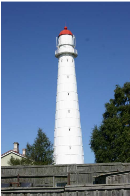
Tahkunan majakka Hiidenmaalla