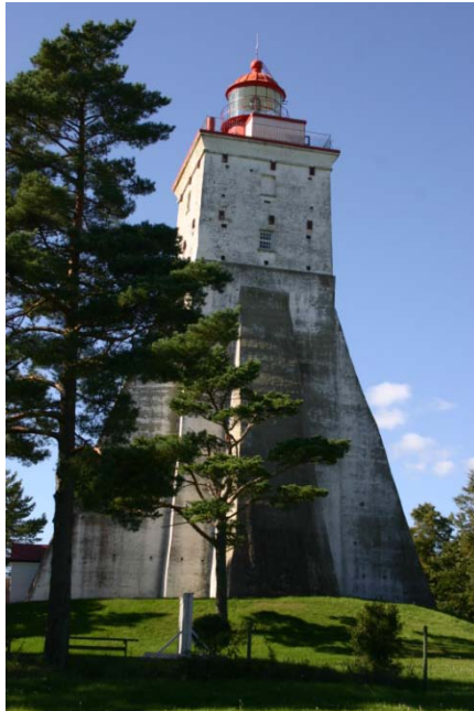
Kõpun majakka Hiidenmaalla