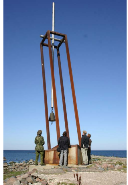
Muistomerkki Estonian onnettomuuden lapsille