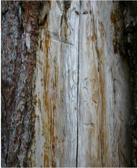
1862 merkkipuu Hiidenmaalta