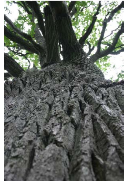
Vanha tammi Hiidenmaalla